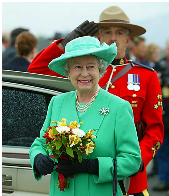
Queen Elizabeth II during her last Royal Tour to B.C. in 2002.