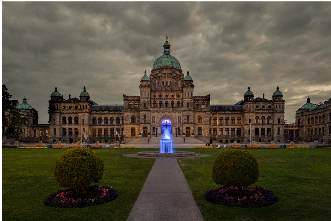
The Parliament Buildings with flags at half-mast and illuminated in royal blue as part of a nation-wide visual tribute to the Queen during the mourning period.