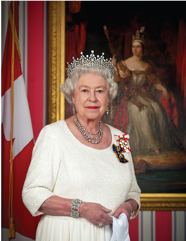
QUEEN ELIZABETH II April 21, 1926 – September 8, 2022