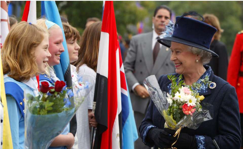
Queen Elizabeth II greeting Girl Guides at the University of British Columbia during her Royal Tour to B.C. to mark her Golden Jubilee in 2002.