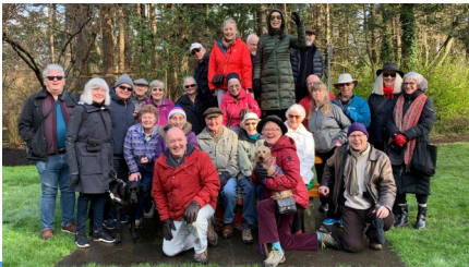
The Walking Group recently enjoyed a stroll around Saxe Point.