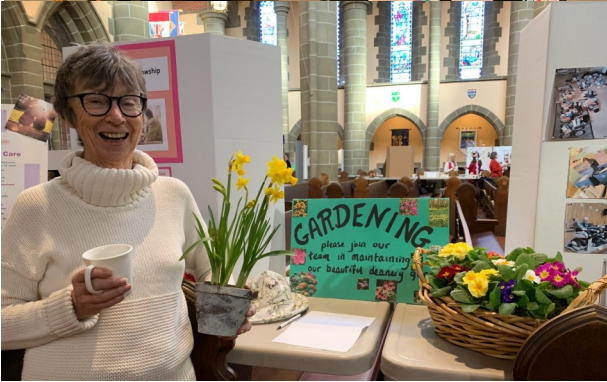
A selection of pictures taken at the AGM on February 23. A great deal of hard work went into the displays for the Living Annual Reports.