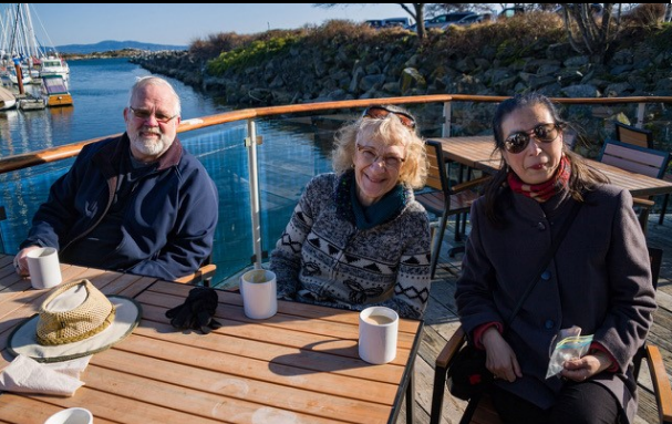
The Walking Group enjoyed a walk around Oak Bay Marina on Wednesday.

It's that time of year again! Join us for the annual Pancake Supper to be held at St John The Divine (Baumann Centre). February 25, 2020. Doors open at 5.30 p.m. with pancakes being served at 6.00 p.m.