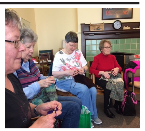
Prayer Shawls: Prayer Shawl Ministry knitters have been gathering regularly to produce their comforting shawls for 10 years.

Today you can see the handiwork of the Cathedral's Prayer Shawl Ministry as the group celebrates its 10th anniversary. The knitters produce more than 100 shawls every year, each one blessed and given to someone whether it is to comfort them during bereavement, after a new baby or during an illness.