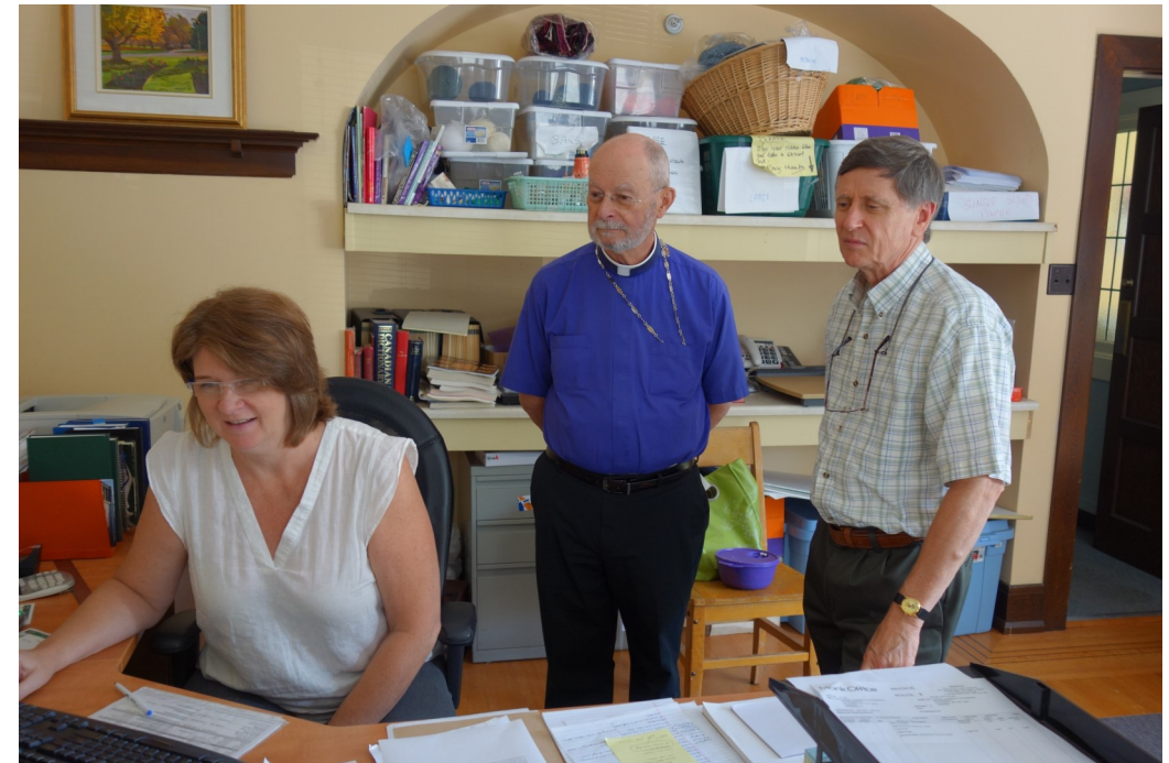
Hard at work in the Parish Administrator's office